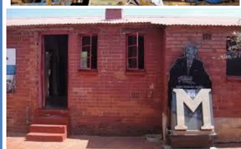
Nelson Mandela's House