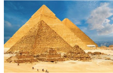
Ancient Egypt Great Pyramids of Giza