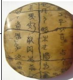
Shang Dynasty Oracle Bone