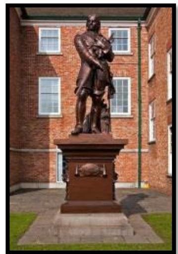
Statue of Cromwell in Warrington.

St Elphin's church which was badly damaged in the Battle of Winwick